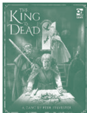
The King is Dead

Available in all good book and game stores or at www.ospreygames.co.uk