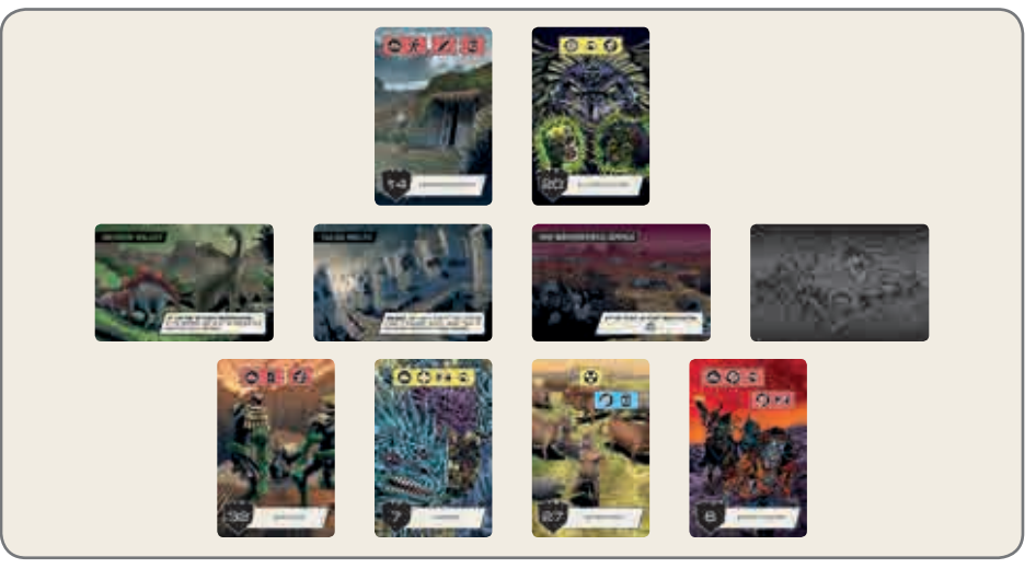
The Senior Judge can choose which of the two rows of encounter cards will form their investigation, or can allow the other player to make the decision for now.